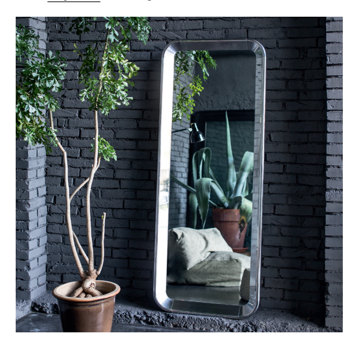
<u>Déjà-vu</u> — design Naoto Fukasawa, 2011